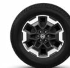
18" ALLOY (LE Grade)