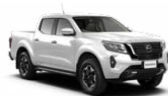
White (S) - QM1