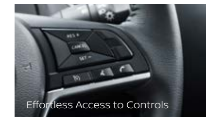
Effortless Access to Controls

Navara maximises storage inside and out. The rear seats feature secure under-seat storage and boast the ability to remain conveniently flipped up to help transport taller items.