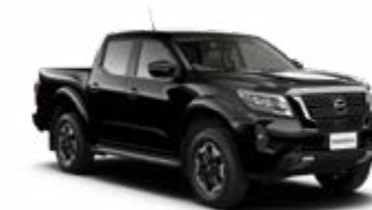
Infinite Black (S) - KH3