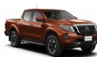
Forged Copper (M) - CAU