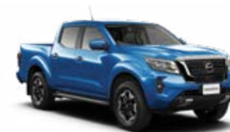
Blue (M) - B16