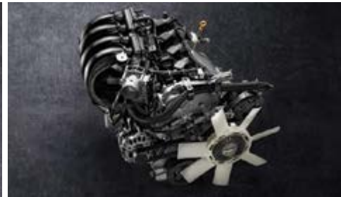
2.5ℓ DDTI INTERCOOLED TURBO DIESEL ENGINE