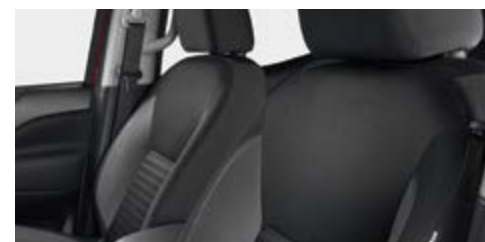
CLOTH SEATS (LE, SE Plus, SE and XE* Plus Single Cab Model) *Grey vinyl option available for XE Single Cab only