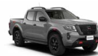
Warrior Grey (PM) - KBY Available on PRO-2X and PRO-4X only