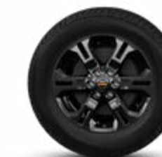
17" ALLOY (PRO-2X and PRO-4X)