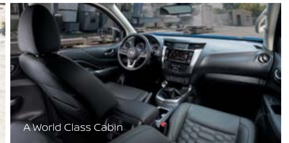
A World Class Cabin