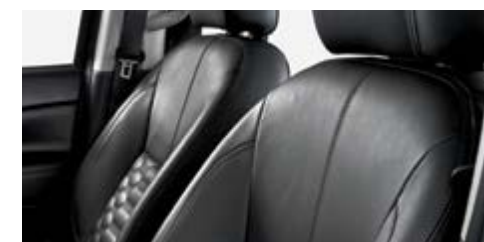
BLACK LEATHER SEATS (LE Plus Model)