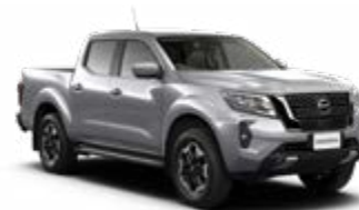
Silver (M) - KY0