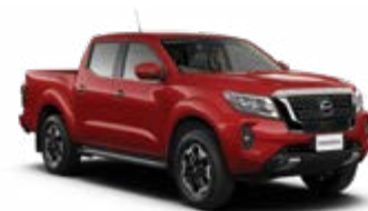
Red (S) - AX6