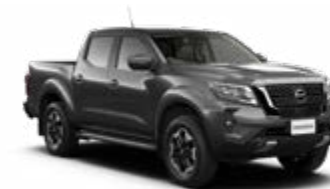
Techno Grey (M) - KY5