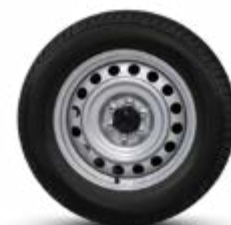
16" STEEL (SINGLE CAB)