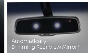
Automatically Dimming Rear View Mirror*