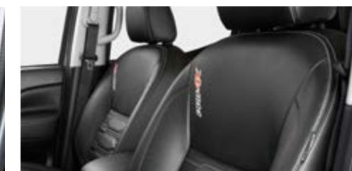
BLACK LEATHER SEATS (PRO-4X Model)