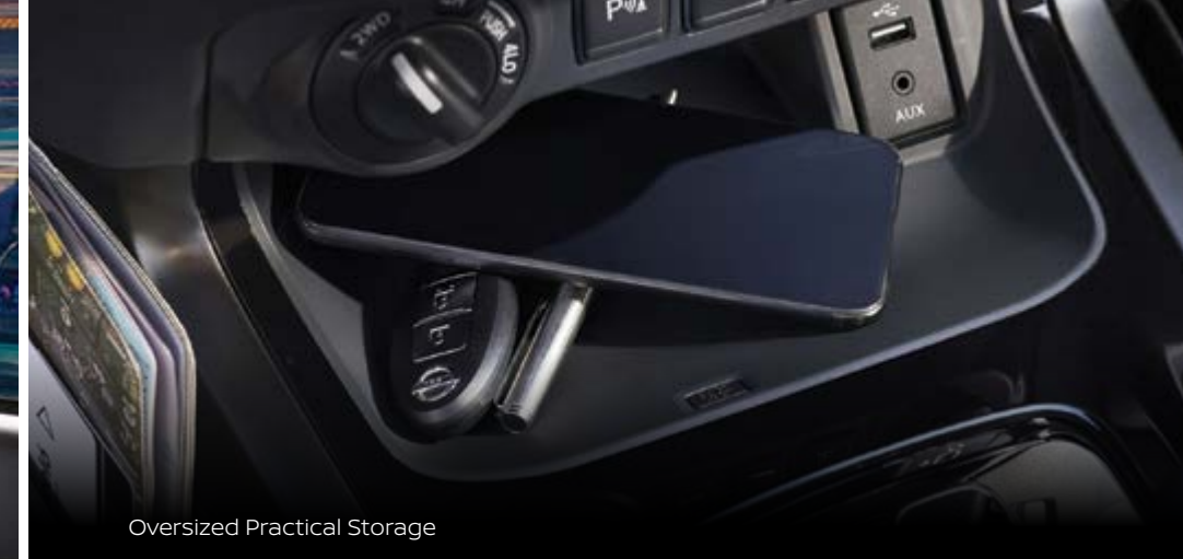
Oversized Practical Storage

Form meets function as you discover how the Navara cabin has been thoughtfully planned out to seamlessly integrate into every moment; be it for work, play or leisure. Generous storage areas, sunglasses stowing, an oversized glove box and multiple charging points make the all-New Navara the perfect companion for everyday life.