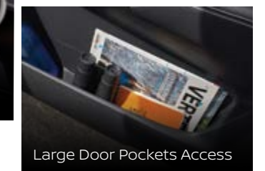
Large Door Pockets Access