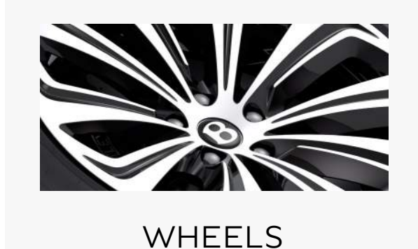
22" TEN SPOKE WHEEL - BLACK PAINTED AND BRIGHT MACHINED