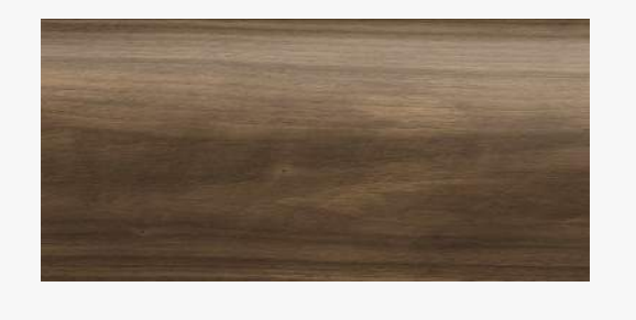
VENEER OPEN PORE CROWN CUT WALNUT